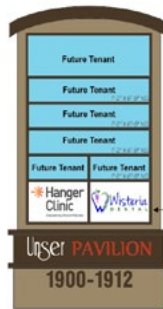
Monument Signage – Building 4